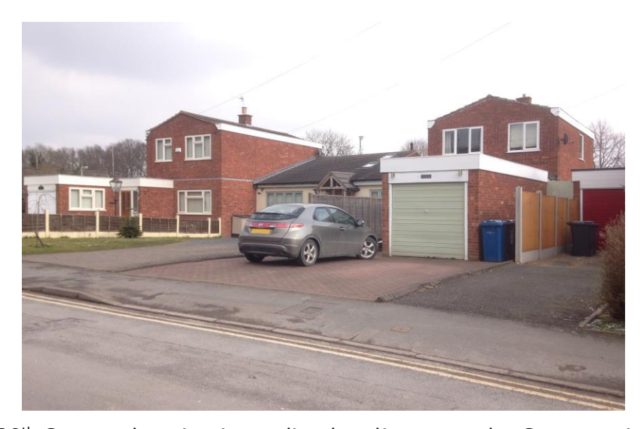
Later 20<sup>th</sup> Century housing immediately adjacent to the Conservation Area

There are also a number of neutral elements within the conservation area. These are buildings or other structures which while not contributing positively to the character of the conservation area nor do they detract from it. These mainly consist of 20^{th} century dwellings.