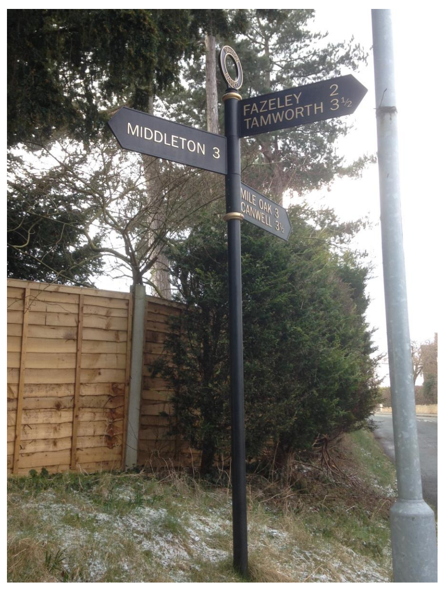
Modern street furniture

More modern street furniture also plays a role in the character of the proposed Conservation Area, with high quality modern additions such as the directional sign at the junction of Drayton Lane and Salts Lane making a positive contribution to the area.