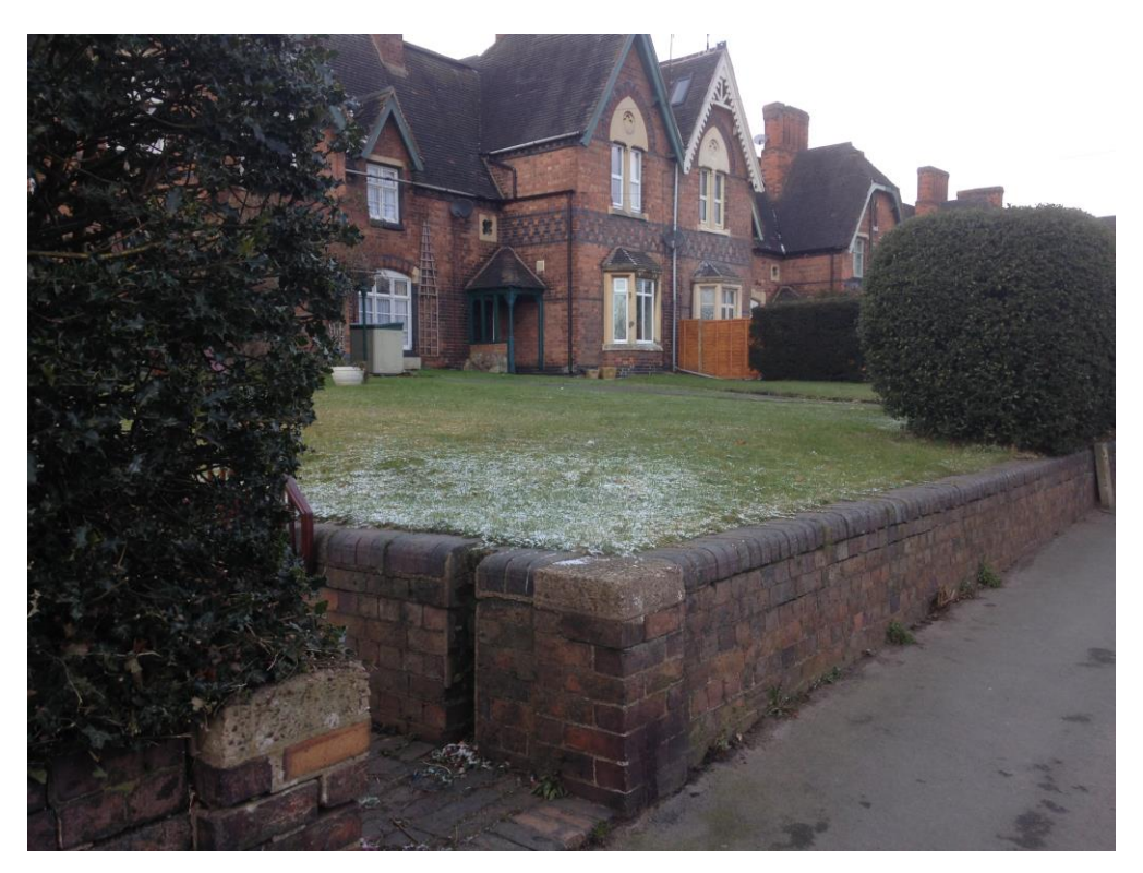
Section of boundary hedge removed, New Row, Drayton Lane

The majority of the buildings are occupied in good condition, and not considered to be at risk. The loss of enclosures to the front of properties, especially along Drayton Lane is detrimental to the character of the proposed Conservation Area.