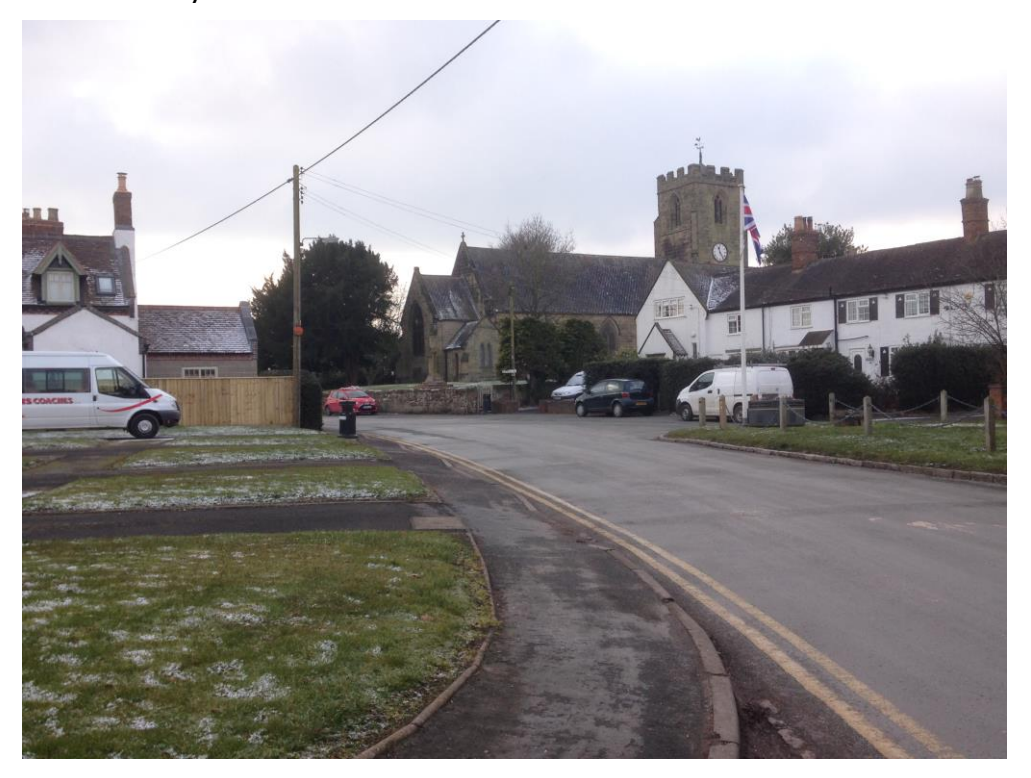
View south towards St. Peters Church from Drayton Lane

The settlement appears to have developed in the late 18<sup>th</sup> and early 19<sup>th</sup> Centuries at the edge of the park associated with Drayton Manor, the seat of the Peel family.