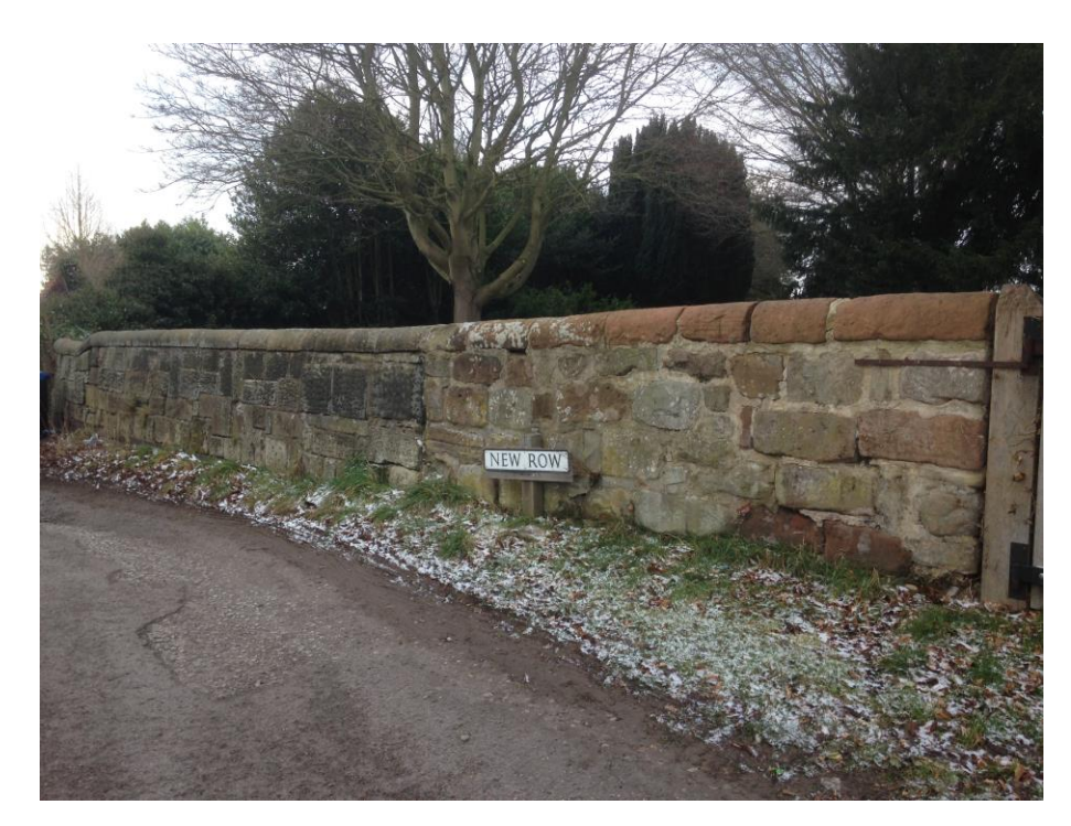
Potential Medieval and Eighteenth Century stonework in Churchyard wall

The natural environment is a key element in the character and the appearance of the Conservation Area. The extensive hedgerows to the front of New Row form a distinctive element to the character of the Conservation Area.