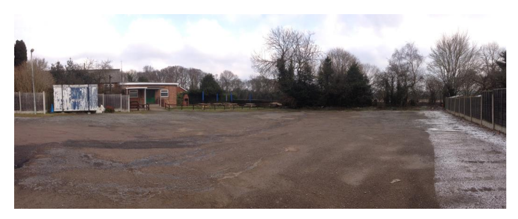
Surface car parking, Drayton Lane

There are a few areas of the conservation area that could be considered to be negative and that detract from the conservation area due to their poor condition.