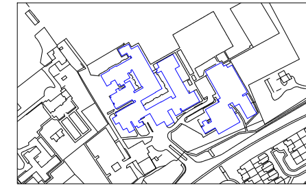
LOCATION PLAN (Scale-NTS)

This product includes mapping data licensed from Ordnance Survey with the permission of the Controller of Her Majesty's Stationery Office (C) Crown Copyright. All rights reserved. Licence Number 100019422.