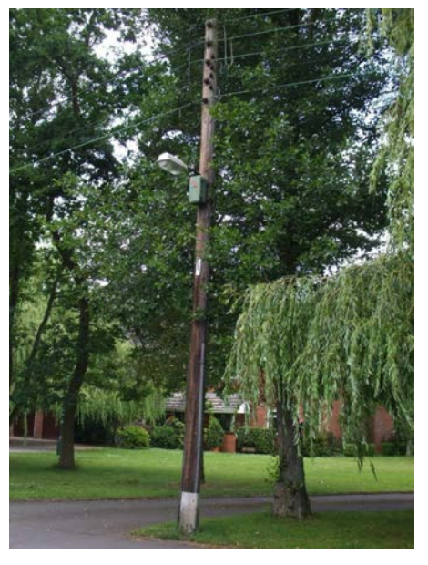
Picture 9.8 A street light on a telegraph pole minimises street clutter

9.5 Street furniture within the village is limited to a post box, a couple of black bins, a couple of benches and a telephone kiosk. This low key level of street furniture ensures that the village does not appear cluttered. A more coherent but equally minimal range of street furniture may improve the appearance of the conservation area.