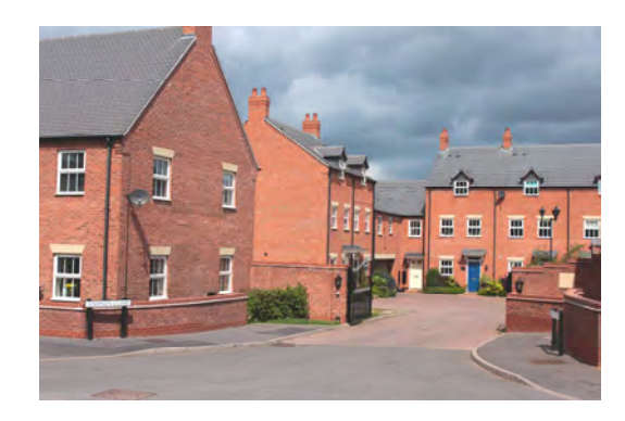
Recent village housing development

elsewhere. There is also an indication that there may be difficulty for some in being able to access the open market to realise their housing needs locally.