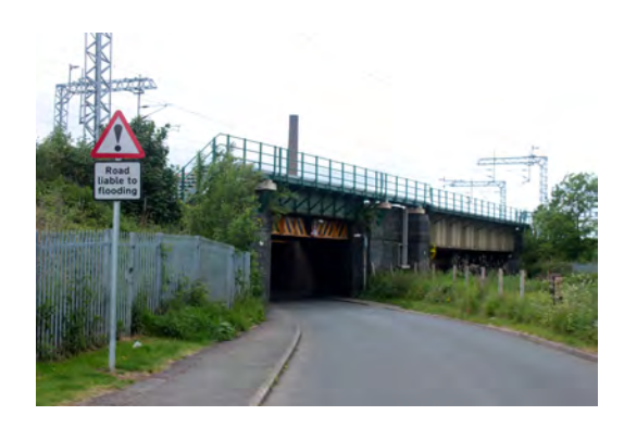
Flood risk area Old Road

46. During the course of the consultation events the issue of flooding was raised on a number of occasions, linked not only to a need to address existing problems in the village, but also to a fear that occurrences of flooding would be likely to be greater if additional development were to take place. A Surface Water Management Plan was prepared for Southern Staffordshire in 2010 and forms part of the evidence base for the Local Development Framework.