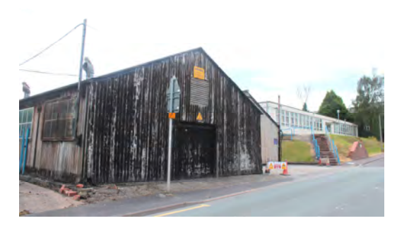
Part of Ideal Standard works, Old Rd.

28. There were varying views on the acceptability of potential locations for development and the workshop groups discussed some of the options. Some felt the need to protect the 'green belt', but one of the workshop groups identified green belt land south of the village as the best location for new development, although it thought that there would be access issues.