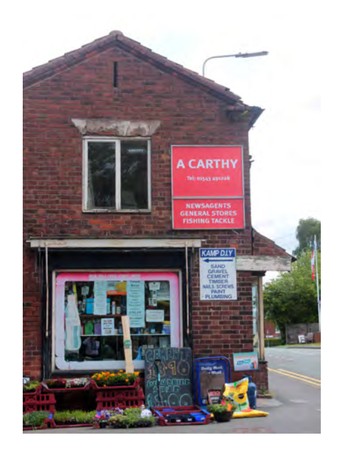
General store New Road

should maintain distinct а separation to ensure no further loss of identity. There was some very limited scope for development to the North and some possibilities for longer term expansion toward the South and West although it would not be easy to achieve new development which has easy access on foot to the heart of the existing settlement due to the nature of previous estate road lavouts."