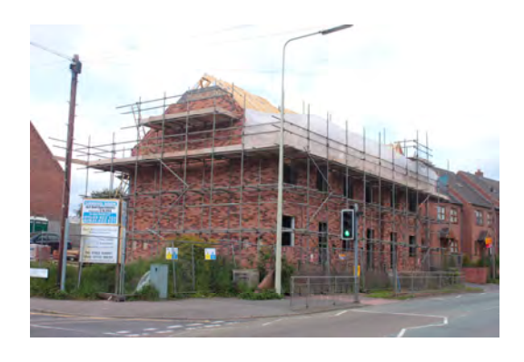
Housing under construction, Handsacre

number of small sites within the village under construction.