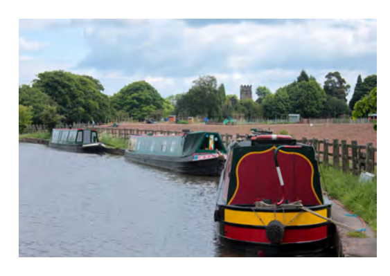
Trent and Mersey Canal Conservation Area

the village, although this is re-enforced by the presence of the River Trent flood plain, which effectively prevents any development north of the canal. The canal however is a Conservation Area and there is therefore a need to conserve and enhance the structure and its setting. It provides a valuable asset to the village in terms of both its environmental and recreational value.