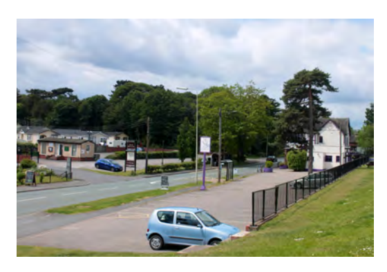
Lower Lodge and the Plum Pudding

11. In terms of traffic management there was a strong view that more traffic management was needed along New Road in the centre of the village. to help slow down traffic and to provide better crossing facilities. This came out as a unanimous view from the workshops. This was related to other issues identified, of lorries travelling through the village and the need for more parking, but in particular it was considered to be an issue of the speed of traffic and the need for more crossing facilities along New Road. This was seen as both a safety issue and an environmental issue affecting the quality of the village environment.