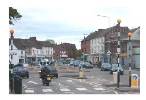
Traffic at Fazeley 'crossroads'

47. As a result of the availability of grant funding for Fazeley centre, and following the de-trunking of the former A5, there has been some past investment in traffic management in the area. This included in particular the scheme that re-designed the roundabout at Fazeley crossroads and related to environmental was improvements. A cyclepath was created with a route out of Tamworth to Drayton Manor, and controlled crossings put in place. Along the former A5 some minor improvements were carried out.