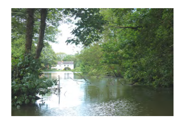
Bourne Brook from Drayton Manor Drive

44. An Ecological Study of Lichfield District (2009 by Staffordshire<sub>10</sub>