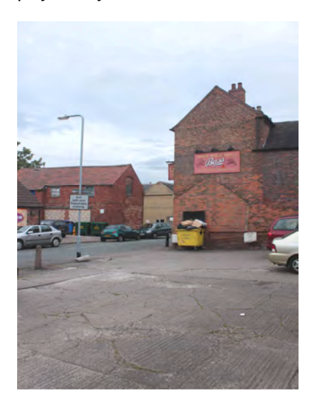
Parking area, Coleshill Street

developing any green belt so as to physically link with Tamworth.