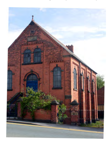
Redundant Fazeley Methodist Church

improvements on the A5, through improvements to the Mile Oak junction, to the need to slow down traffic on both the Sutton Road and the former A5, the principal link road within the settlement. The feasibility of some of the suggestions, such as mini-roundabouts. lowering some cycleways, speed limits. more crossings and 'reshaping the highway to become a local street' (CABE) need further investigation with the County Council as Highway Authority.