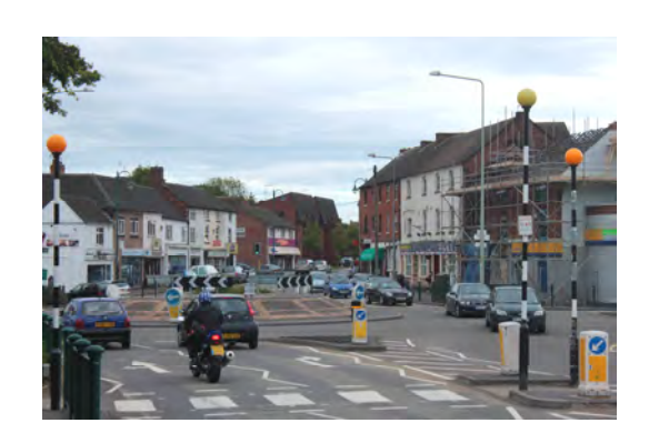
Lichfield District Council September 2011

NB – To be read in conjunction with the Introduction and Conclusion Reports. November 2011